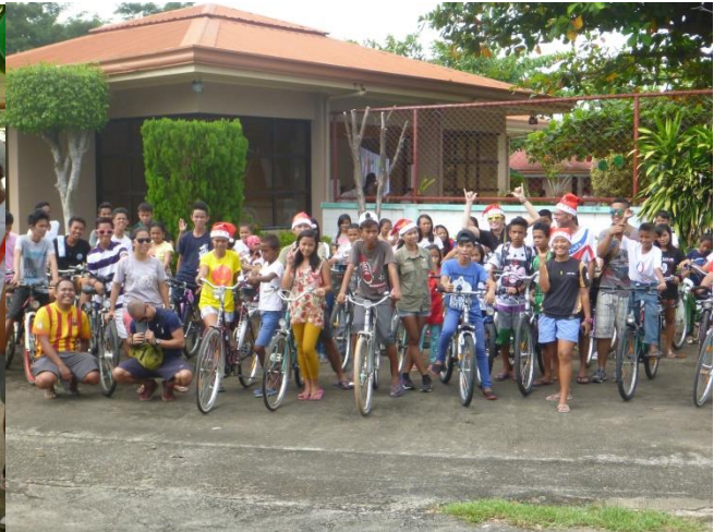
Excited leaps for the bikes to keep...

established strong bond which led them to be one and work as one. Children were able to experience the spirit of Christmas and were able to understand its true meaning by simply being with everyone and through receiving their one of the most special gifts this Christmas and that was the bikes. Everyone expressed their love by means of sharing their quality time with each other and exchanging of gifts. The said activity made the scholars enjoy each moment of fun and excitement. Furthermore, the activity is also a venue for children to be in their natural manner where they can be better-off in their own special way. Sharing every moment on the swimming pool with everybody sealed their happiness on the entire activity.