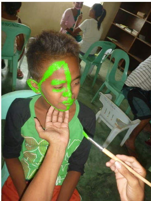
Where a colored face takes place...