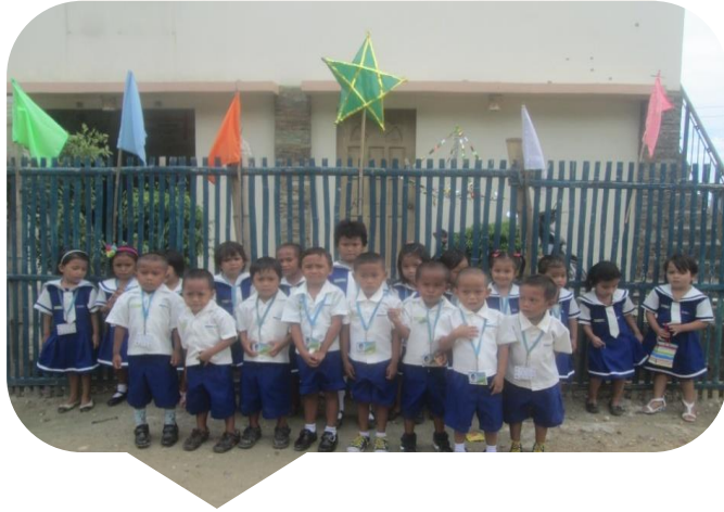
New uniforms and design with logos of SignAsia Foundation and JusticeF