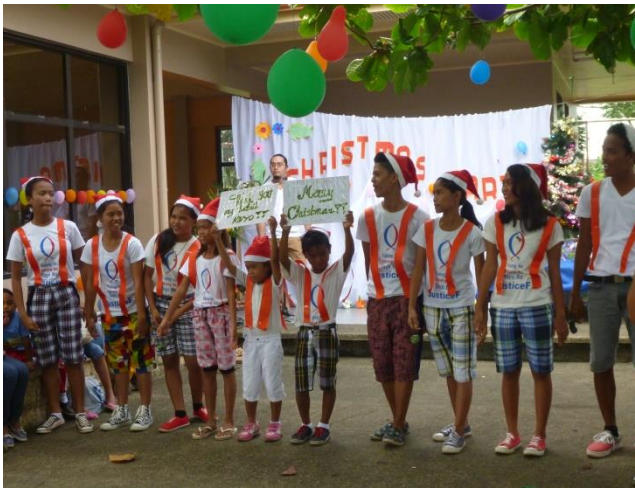
Singing Christmas carol brings joy for all...