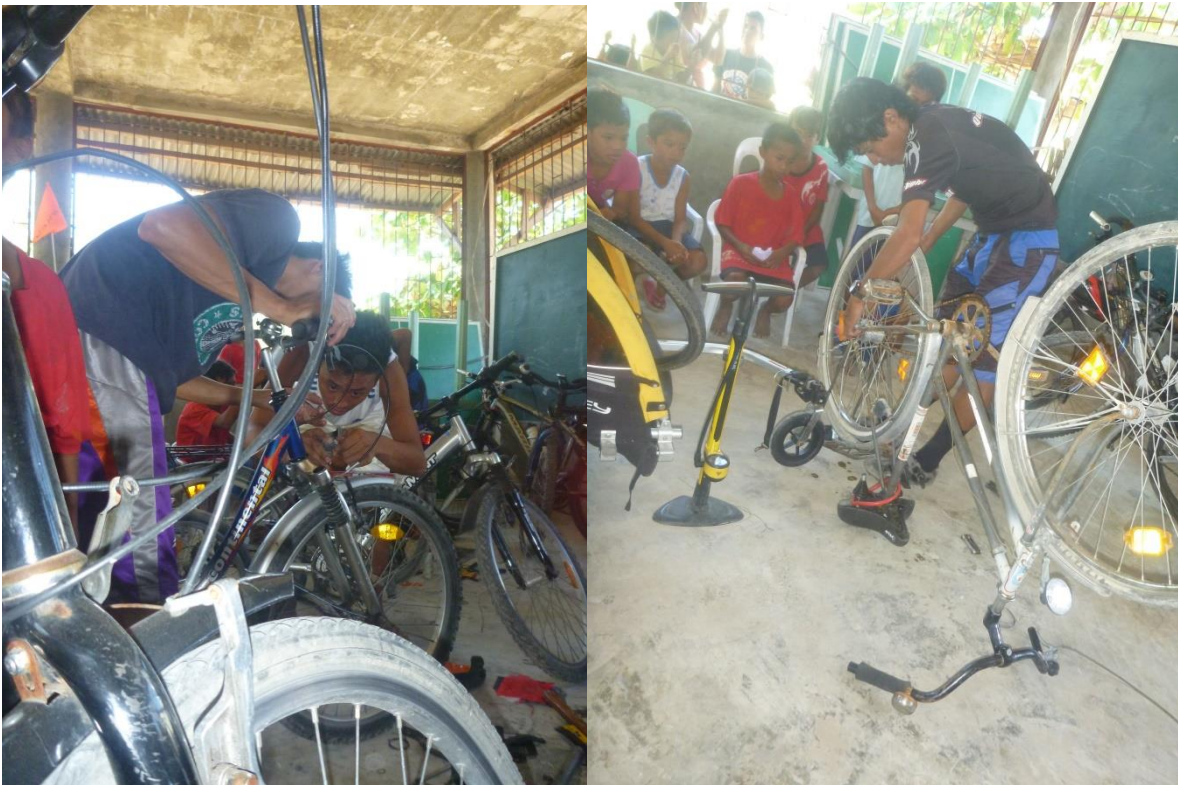
Everyone liked taking good care of their bikes

Last March 1, we had a very successful bike workshop. The scholars were able to learn the basics of repairing their bikes. There was a short orientation done before the workshop in which the scholars got some ideas of what to do and what will happen during the workshop. It was a long day for the scholars and for the facilitators yet it was a fruitful one because most of the bikes were repaired and the scholars were given an assurance of continuous training until they are able to repair on their own bikes.