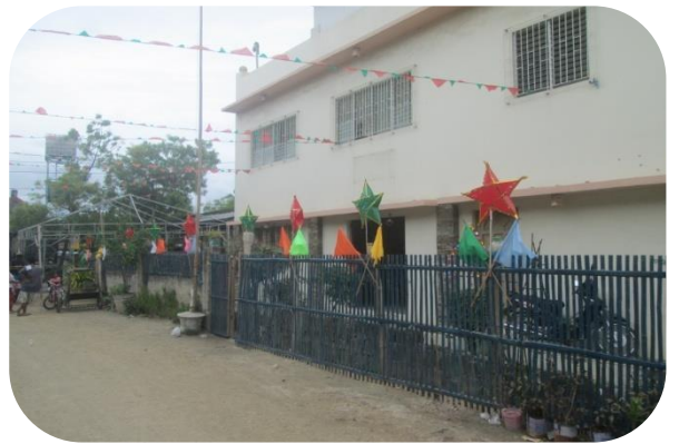
The school beautification during Christmas season.