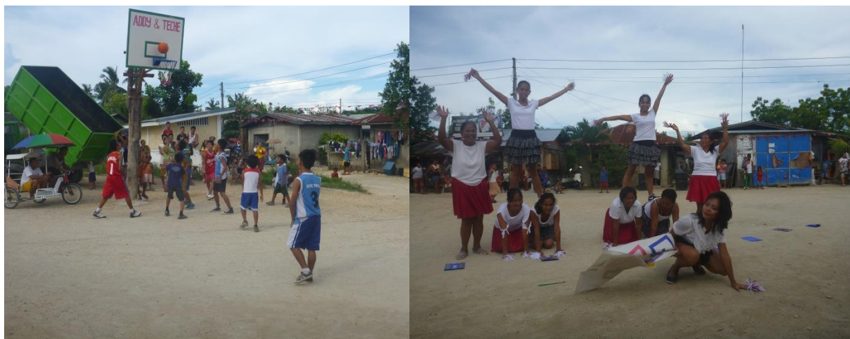
Nice move of the parents who groove...