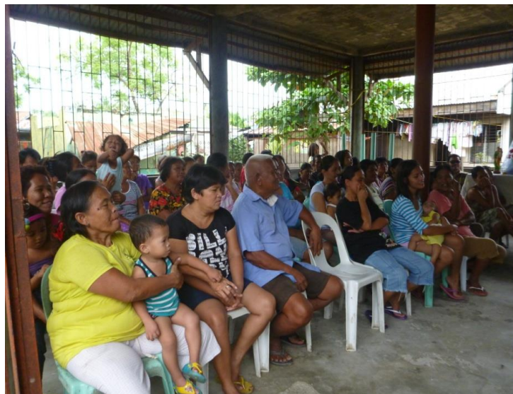
Peoples' Organization monthly meeting