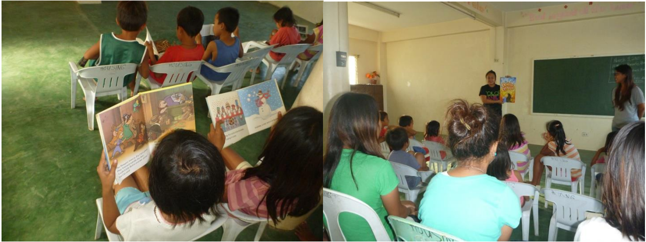
Learning took place by reading books with pace... Story telling is what made the books more interesting...