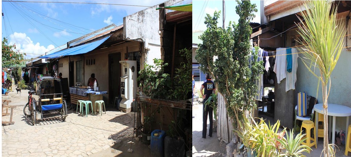
Illegal extension of structures partially cleared

of illegal structures - both partial/full - was implemented by majority of the concerned families and the remaining is a total of 29 houses/families. Some requested for assistance from the Task Force to substantiate the proper clearance of affected area and for economic reasons.