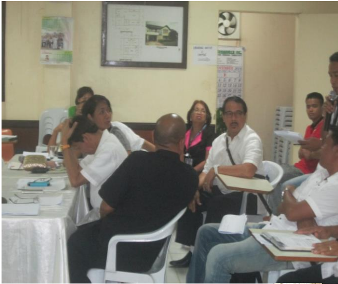
Municipal Housing Board meeting where the LGU's Collector did first reporting.

The following are photo documentation of conducted activities: