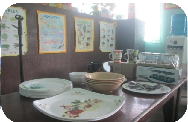
We have our second PTCA project for the school year (kitchen utensils, microphone stand and Back drop for the stage).