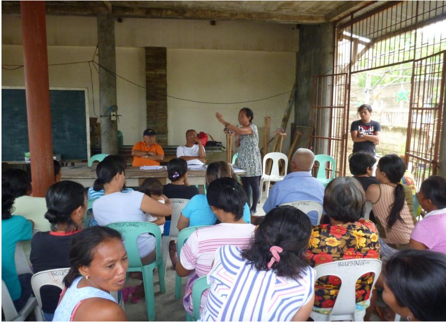
Joint meeting with the Municipal Mayor / project staff and organizational general assembly meeting

Instead of group meetings, the CO did individual follow ups and informal discussion. PO meeting is suspended until the compliance of organizational registration.